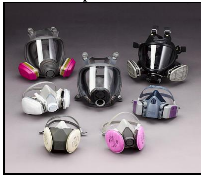
Full & Half Face Respirators