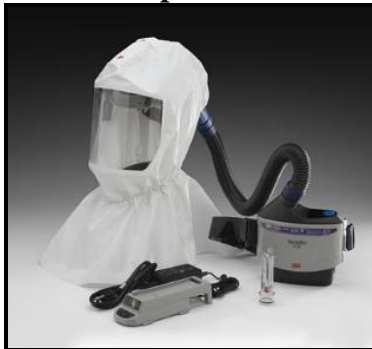
Powered Air Purifying Respirators