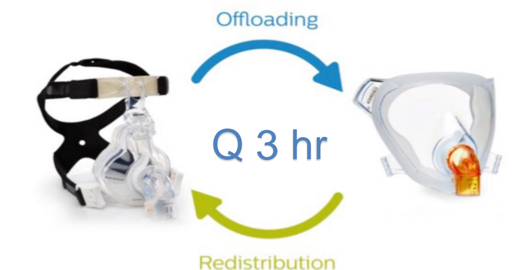
Figure 2: Mask Rotation Schedule