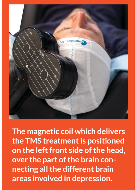
The magnetic coil which delivers the TMS treatment is positioned on the left front side of the head, over the part of the brain connecting all the different brain areas involved in depression.